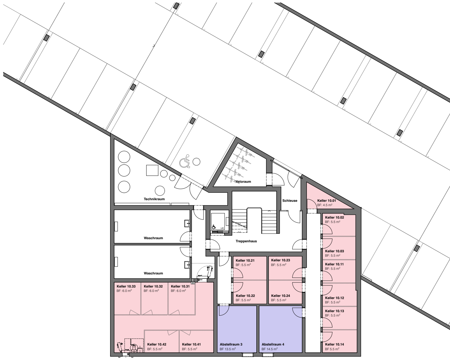
Haus 10 Untergeschoss